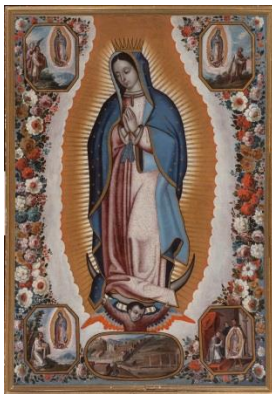
Antonio de Torres (Mexico, 1667–1731)

Virgin of Guadalupe (Virgen de Guadalupe), c. 1725