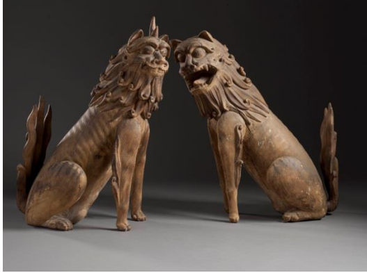
Pair of Lions, 9th century