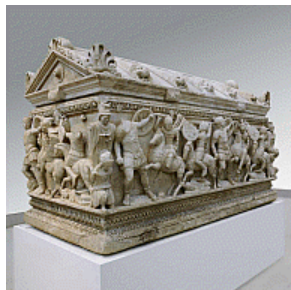
Roman Sarcophagus Depicting a Battle between Soldiers and Amazons (Warrior Women) , A.D. 140–170 Marble 40 1/2 x 91 1/2 x 50 1/2 in. (102.9 x 232.4 x 128.3 cm) Museum purchase with funds provided by the Agnes Cullen Arnold Endowment Fund in memory of Peter C. Marzio

Diana Al-Hadid, American, born 1981 Untitled , 2010 Xerox transfer, charcoal, Conté crayon, and pastel on vellum paper 40 x 20 1/8 in. (101.6 x 51.1 cm) Gift of Lea Weingarten in memory of Peter C. Marzio