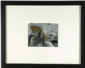
Ken Mazzu, American, born 1967 Sleeping Giant , 2006 Ink on paper 4 3/8 x 5 1/2 in. (11.1 x 14 cm) Gift of Clinton T. Willour in memory of Peter C. Marzio