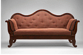
Attributed to the shop of Johann Michael Jahn, American, born Pomerania, 1816–1883 Sofa , c. 1846–60 Empire Sofa , c. 1846–60 Black walnut, black walnut veneer, and unidentified secondary woods 42 1/2 x 81 1/2 x 27 3/8 in. (108 x 207 x 69.5 cm) The Bayou Bend Collection, gift of William J. Hill in memory of Peter C. Marzio